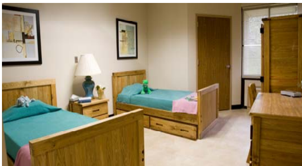
Detox and Women's Programs at Austin Recovery's Edith Royal Campus

Separate Men's & Women's Campus: Our residential programs afford clients the safe and supportive environment needed to make the healthy changes that recovery requires. Our Men's Program is located in South Austin on our 40-acre ranch, while women receive treatment on our 8-acre campus conveniently located in Northeast Austin. Lengths of stay are thirty to forty-five days.