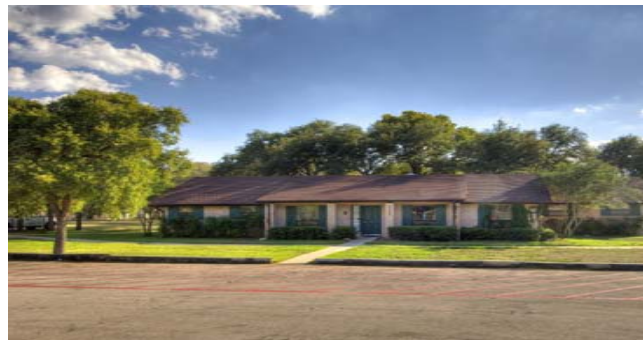
Men's Long Term Program at Austin Recovery's Lodge

Long Term Programs: The National Institute of Drug Abuse notes that "...for most patients, the threshold of significant improvement is reached at about three months of treatment." Clients with a history of relapse or requiring improved life-skills often benefit from longer-term treatment. Following their initial 30 days of treatment we offer the additional time for healing needed by many clients. Our men receive treatment at Austin Recovery's Lodge located on a tranquil 12-acre site in South Austin, while women transition to our facilities located on the Edith Royal Campus.