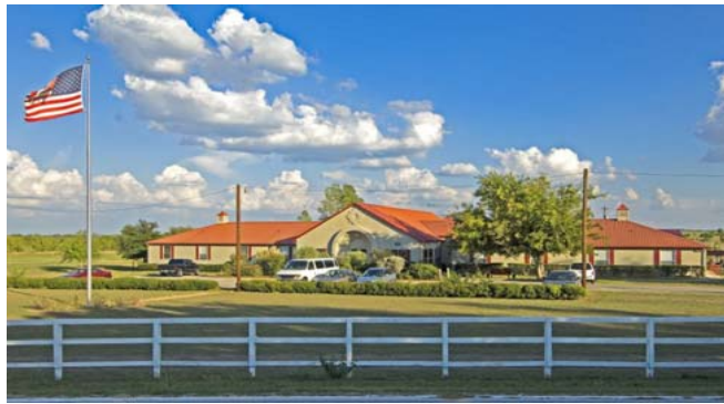
Men's Program at Austin Recovery's Hicks Family Ranch

Long Term Programs: The National Institute of Drug Abuse notes that "...for most patients, the threshold of significant improvement is reached at about three months of treatment." Clients with a history of relapse or requiring improved life-skills often benefit from longer-term treatment. Following their initial 30 days of treatment we offer the additional time for healing needed by many clients. Our men receive treatment at Austin Recovery's Lodge located on a tranquil 12-acre site in South Austin, while women transition to our facilities located on the Edith Royal Campus.