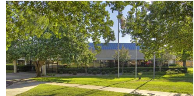
Austin Recovery's Edith Royal Campus